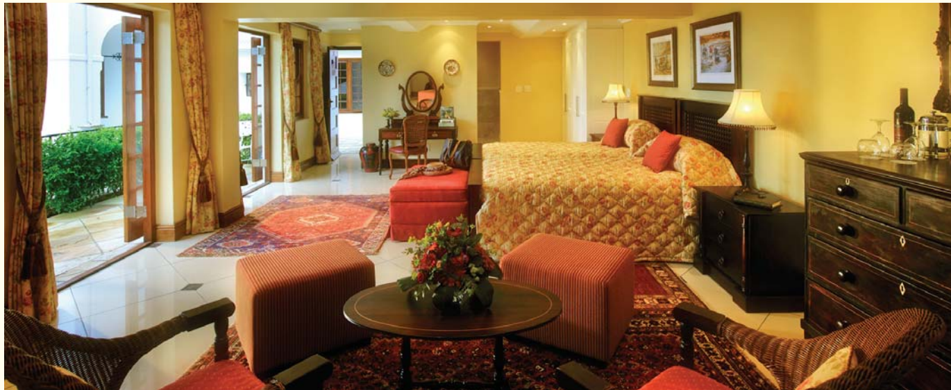
THE ST JAMES MANOR