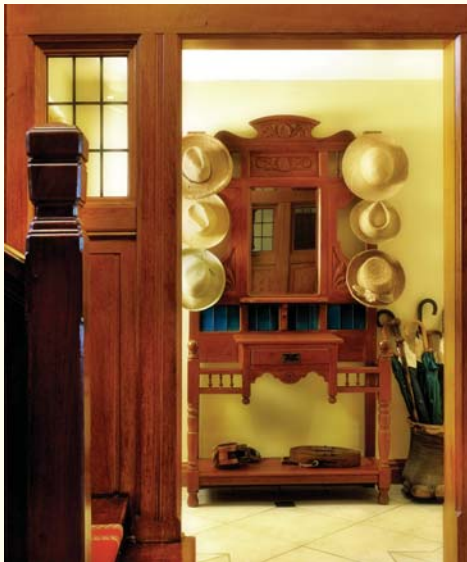
A Stately Seaside Retreat