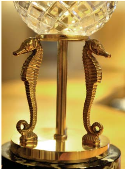
THE POOL DECK