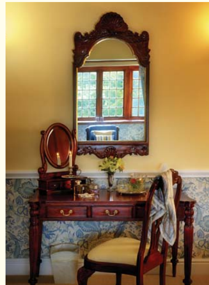
A Stately Seaside Retreat