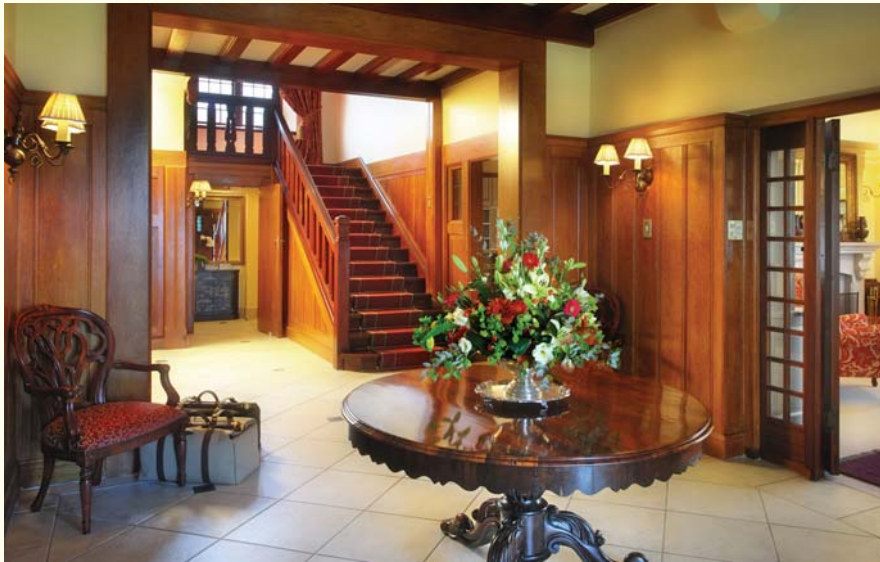
A Stately Seaside Retreat