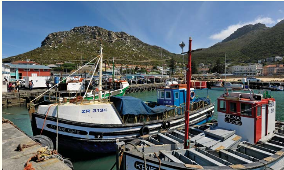
THE ST JAMES MANOR