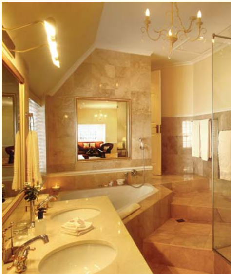
A Stately Seaside Retreat