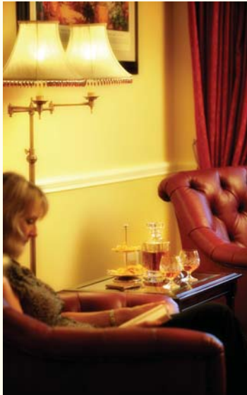
A Stately Seaside Retreat